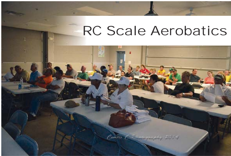
Sunday night's pilots' meeting and judging refresher.