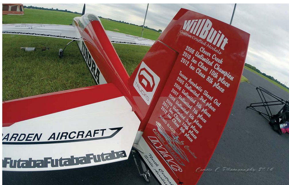
A couple of the models that made an appearance at Sunday's practice.