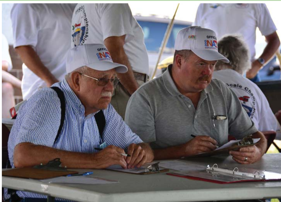
Scale static judges carefully look over documentation during the 2013 Nats.