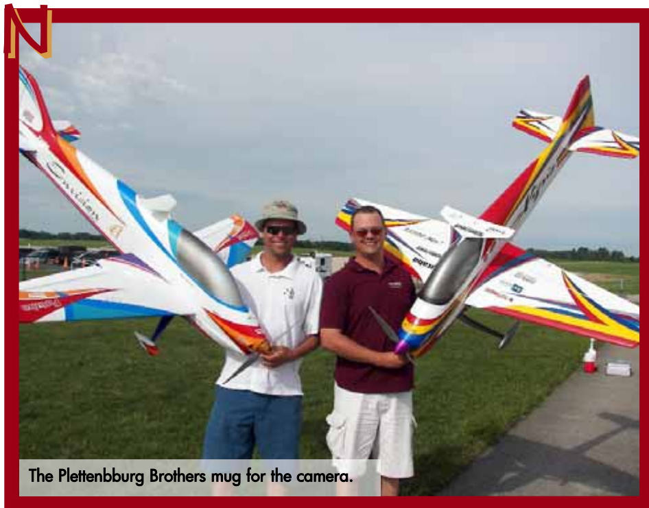
The Plettenburg Brothers mug for the camera.

He is running a simple Hacker C50 inrunner motor with the gear box disconnected. This system allows him to run two 22 x 18 contra-rotating props which cancel out the P-Factor. They transmit no prop swirl to the surfaces, they give increased