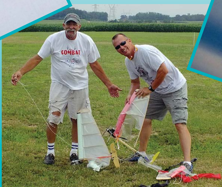
Above: The gory aftermath and two adrenaline-junky pilots.