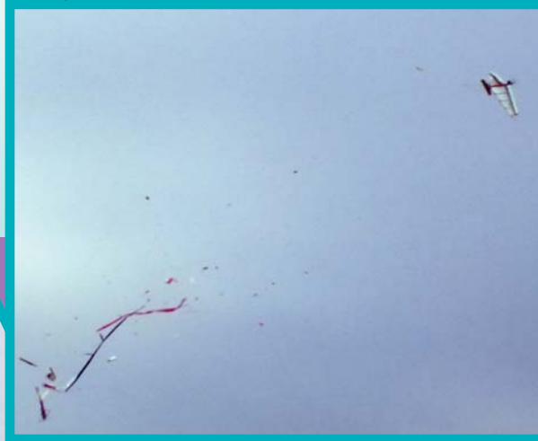
A midair with a kill. Fast action at its most crowd pleasing.