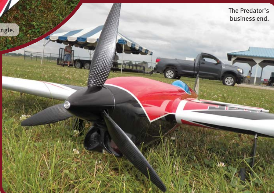
The Predator's business end.