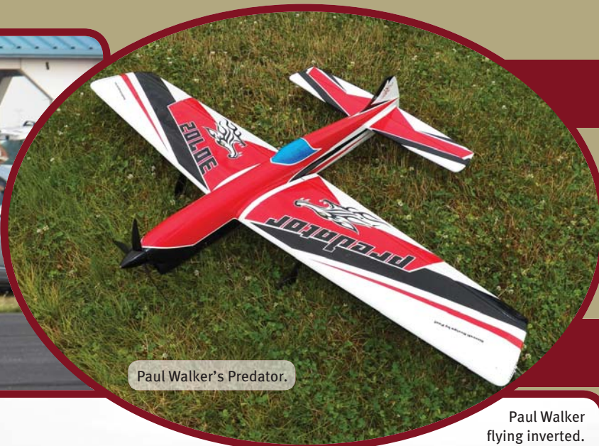
Paul Walker's Predator.