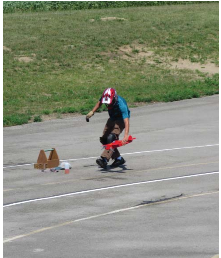
Does this count?