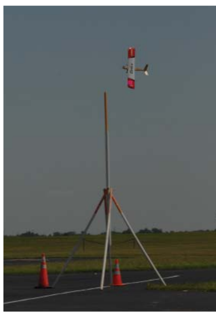
Rocket Ray's (center) perfect line around 2 and 3.