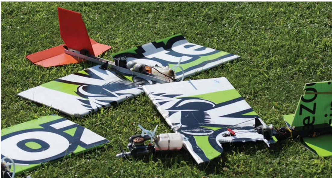
Someone tried to eat a Gnat.