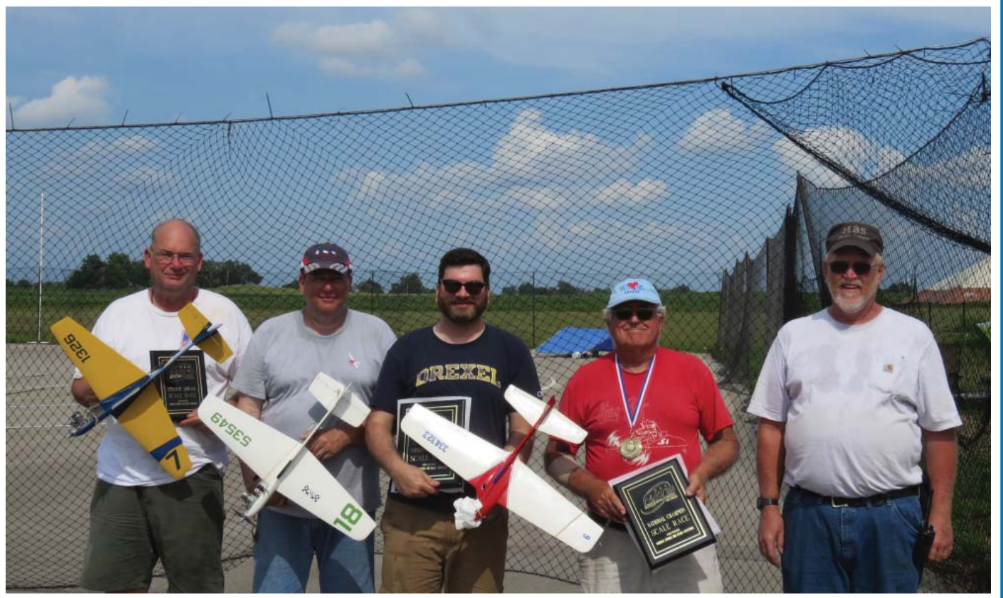
Scale Race winners.