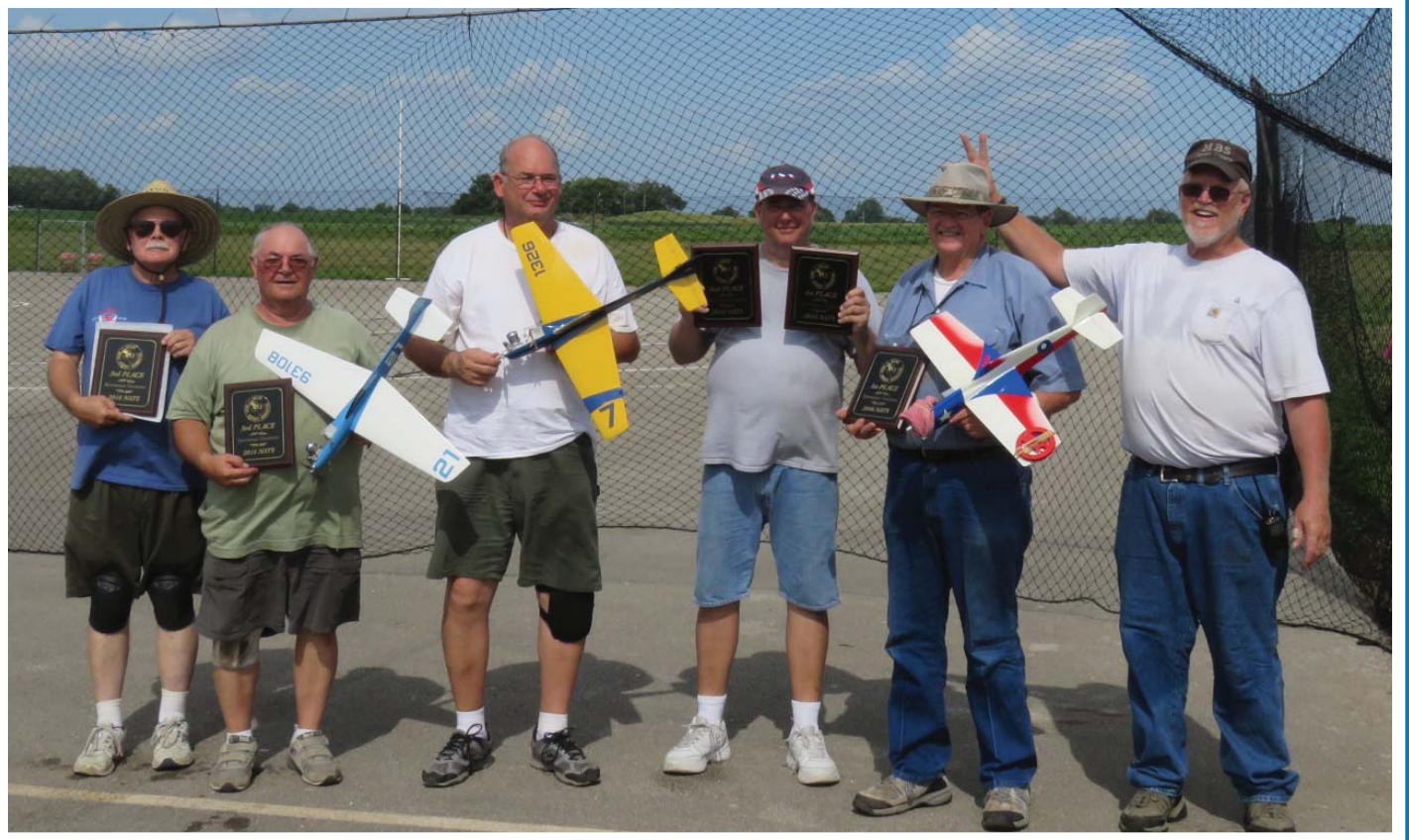
Sport Goodyear winners.