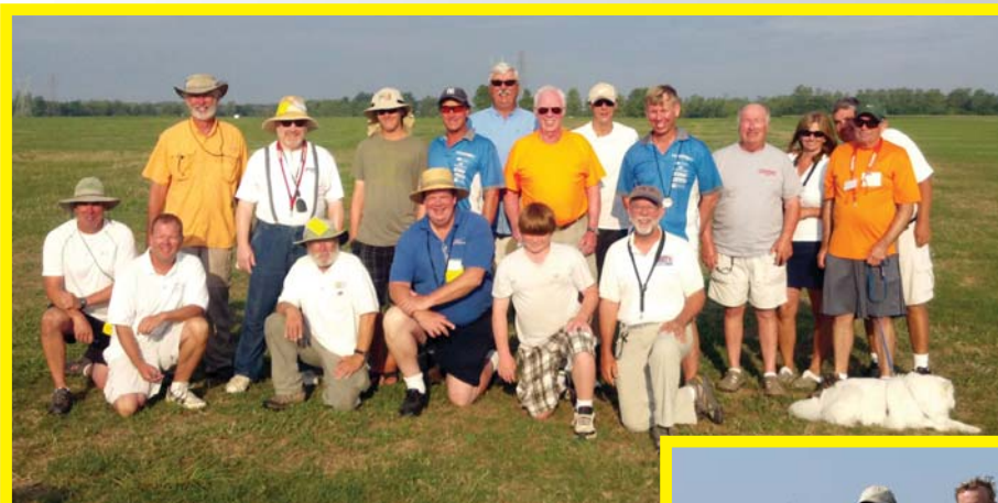
The Eastern Soaring League brought a large group.