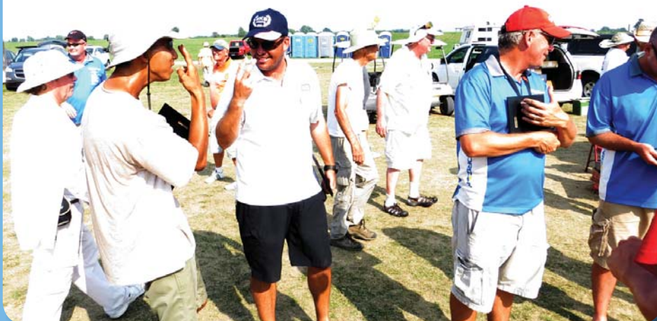
Some of the winners relive contest moments.